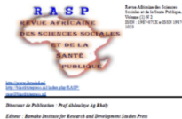
Figure 4: Example of article published in French, where article title has not been translated into English © 2019. This work is openly licensed via CC BY 4.0 .

Mots-clés: enseignement, apprentissage, grammaire, langue maternelle, langue étrangère